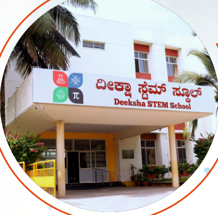
Deeksha STEM School, Bannerghatta Road, Bengaluru