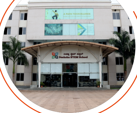
Deeksha STEM School, Vidyanagar, Bengaluru