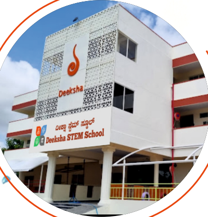
Deeksha STEM School, Kengeri, Bengaluru