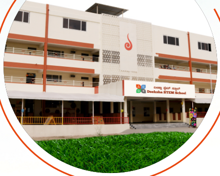
Deeksha STEM School, Judicial Layout, Bengaluru